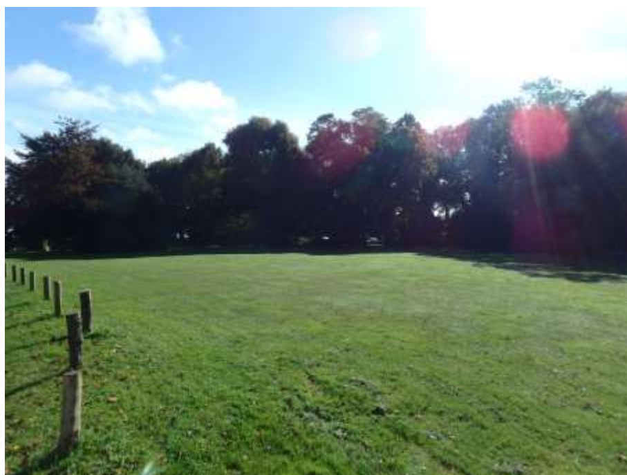
Photograph 5: Hamble green