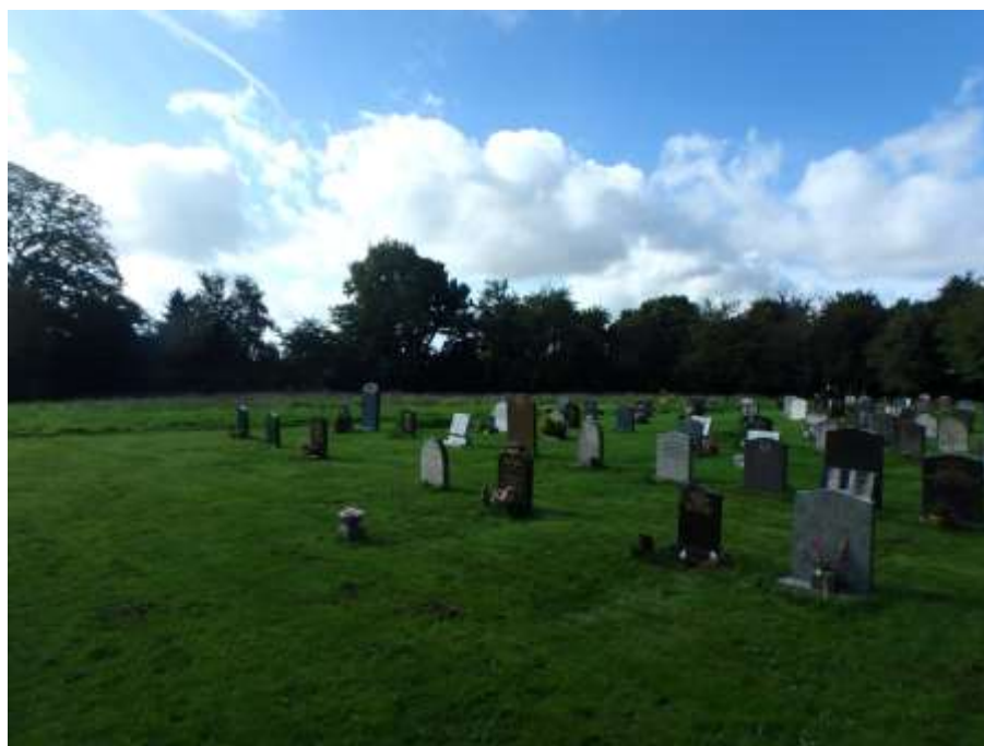
Photograph 2: Different mowing regimes in cemetery