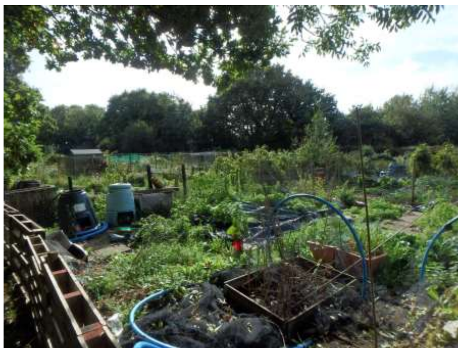
Photograph 1: Plots in allotment