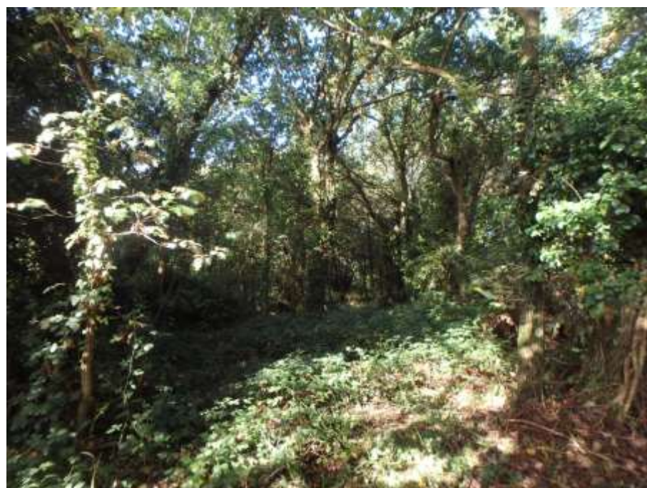
Photograph 6: Heather gardens