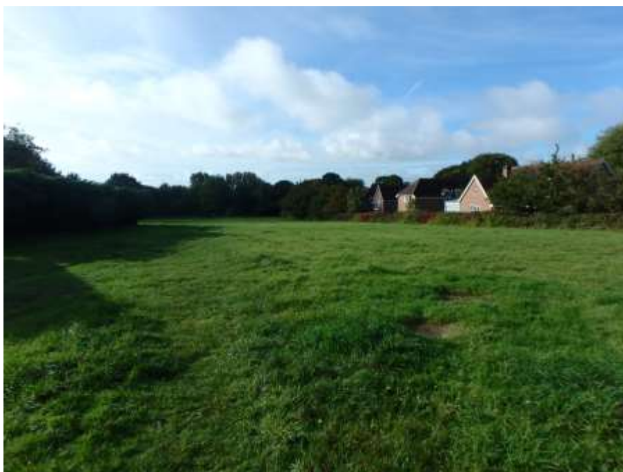
Photograph 4: Donkey derby field