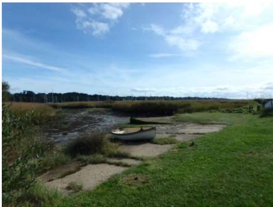
Photograph 7: Mercury marshes