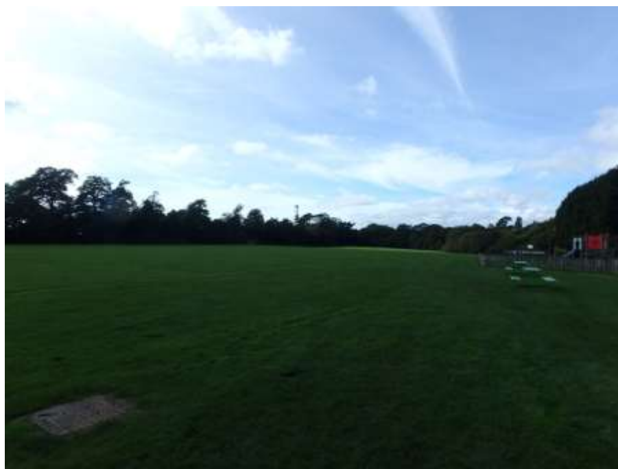
Photograph 8: Mount pleasant recreation ground