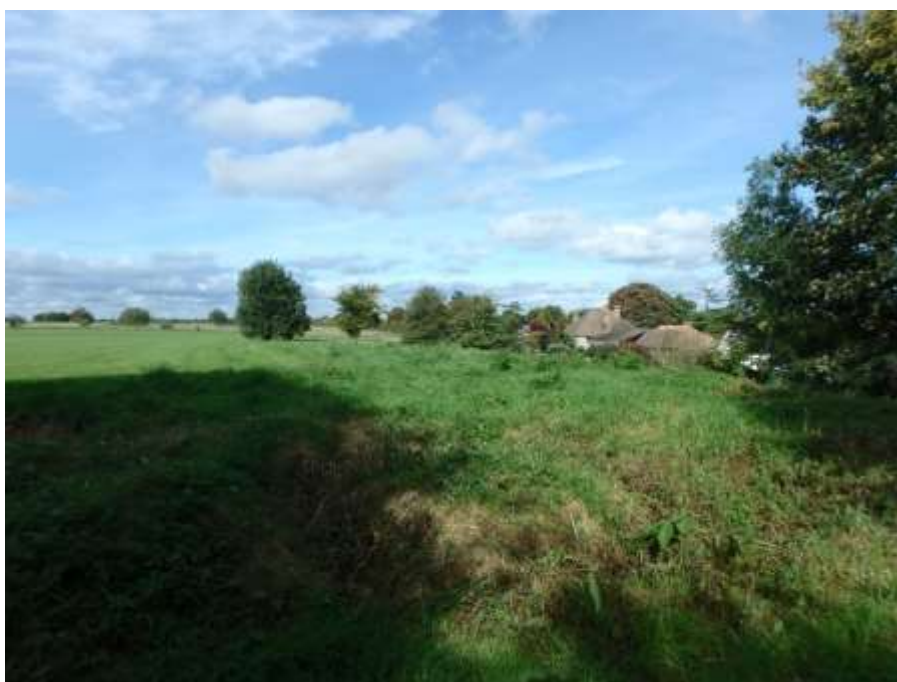
Photograph 3: Area for proposed orchard on college playing field