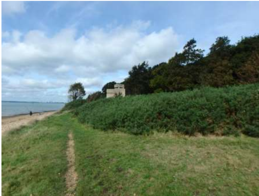
Photograph 9: Westfield common